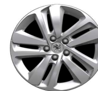
17" 'Phoenix' alloy wheel Option