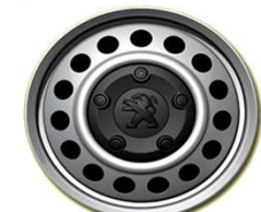
17" steel wheel with black centre cap