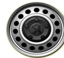
16" steel wheel with black centre cap