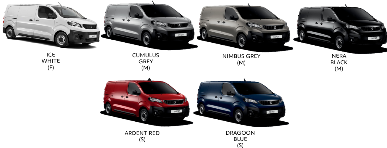
ICE WHITE (F)