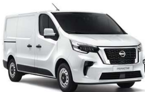
Glacier White - S WHI/369