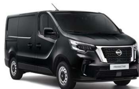
Jet Black - M BLK/D68