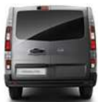
180 OR 270° GLAZED FRENCH DOORS