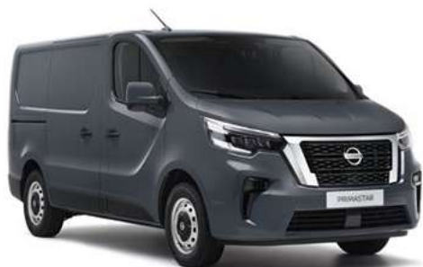
Urban Grey - S GRU/KPW