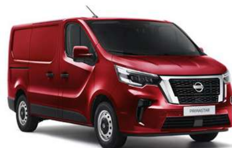
Carmin Red* - M RCM/NPF