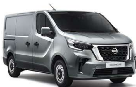
Stone Grey (1) - M GHG/KQA