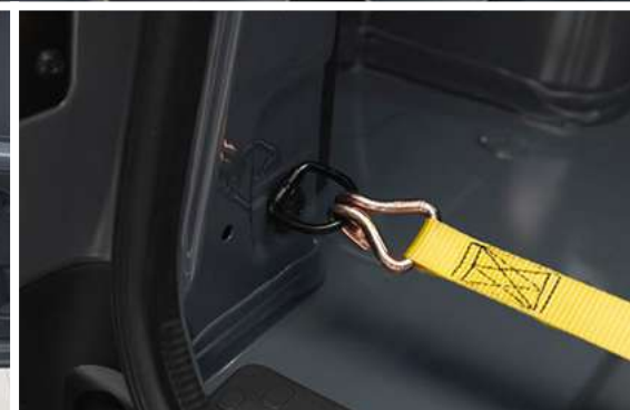
Up to 16 built-in side and floor mounted tie-downs to keep your load secure.