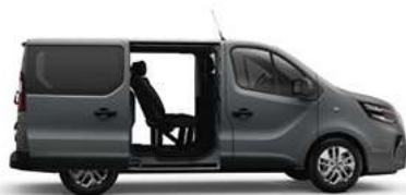
2 SLIDING DOORS