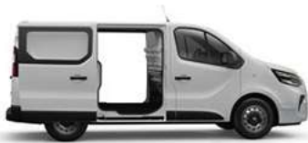
2 SLIDING DOORS