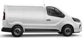
NO SLIDING DOOR