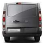
180 OR 270° PANELLED FRENCH DOORS