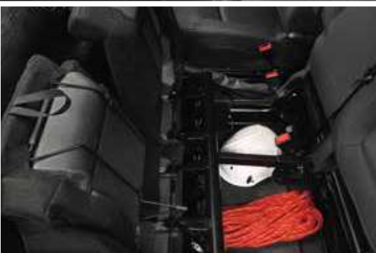
54 litres of storage beneath the passenger seats*