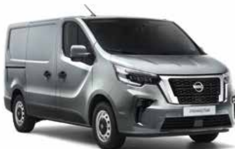
Highland Grey - M GHG