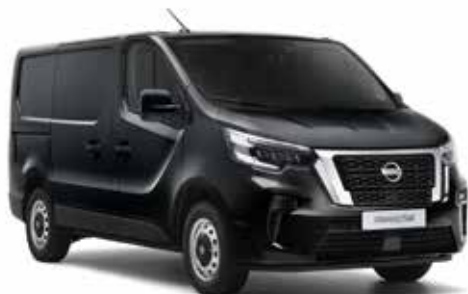
Jet Black - S BLK