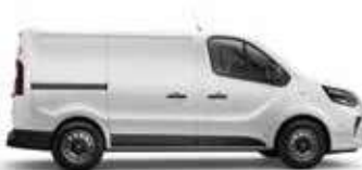
1 SLIDING DOOR