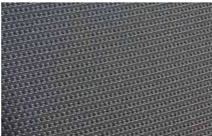
Grey - Dark Grey Standard on Visia/Acenta