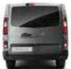
180 OR 270° GLAZED FRENCH DOORS