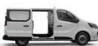
2 SLIDING DOORS