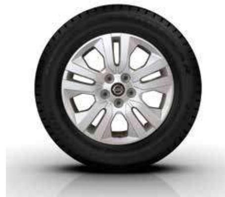
17" Alloy Wheel Standard on Tekna and Tekna+