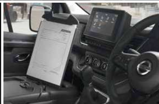
Mobile Office functionality*

*Features available depending on version and grade, as standard or only as option (at an extra charge)