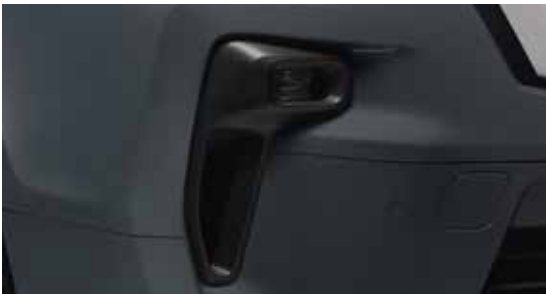
Side vents with LED fog lamps

Features available depending on version and grade, as standard or only as option (at an extra charge)