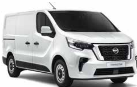
Glacier White - S WHI