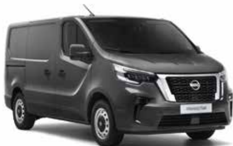
Comet Grey** - M GCM