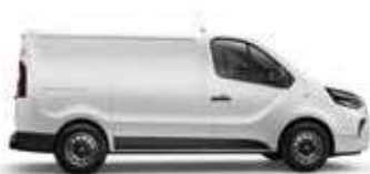
NO SLIDING DOOR