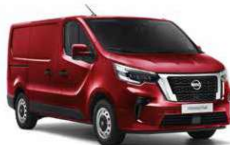
Carmin Red** - M RCM