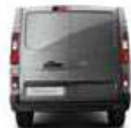
180 OR 270° PANELLED FRENCH DOORS