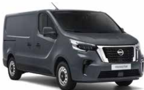
Urban Grey - S GRU