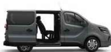
2 SLIDING DOORS