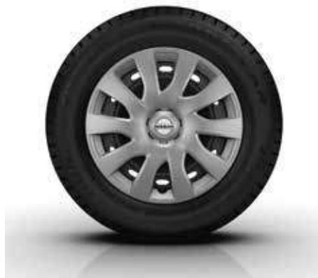
16" Wheel Cover Standard on Acenta grade