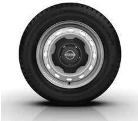
16" Steel wheel Standard on Visia grade