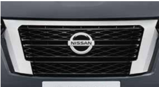
Distinctive Interlock-grille design