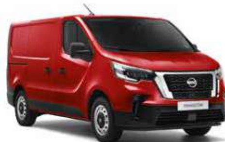
Magma Red* - S RMB/R70