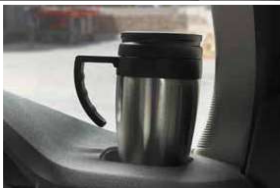
Convenient cup holder to safely hold your beverage*