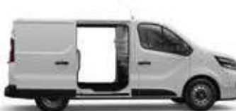
2 SLIDING DOORS