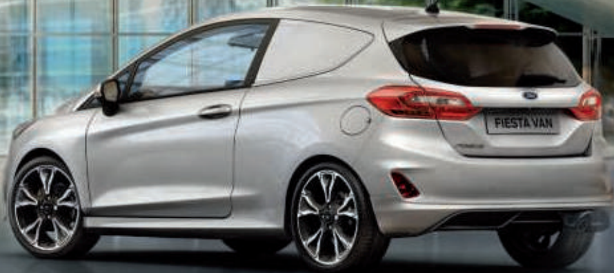
Fiesta Sport Van with Moondust Silver metallic body colour (option) and 18" Rock Metallic machined alloy wheels (option).