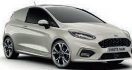
Metropolis White Metallic body colour*†