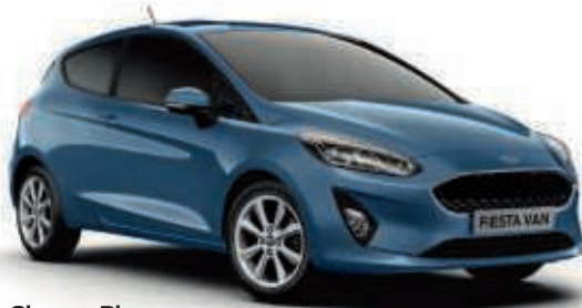
Chrome Blue Metallic body colour*