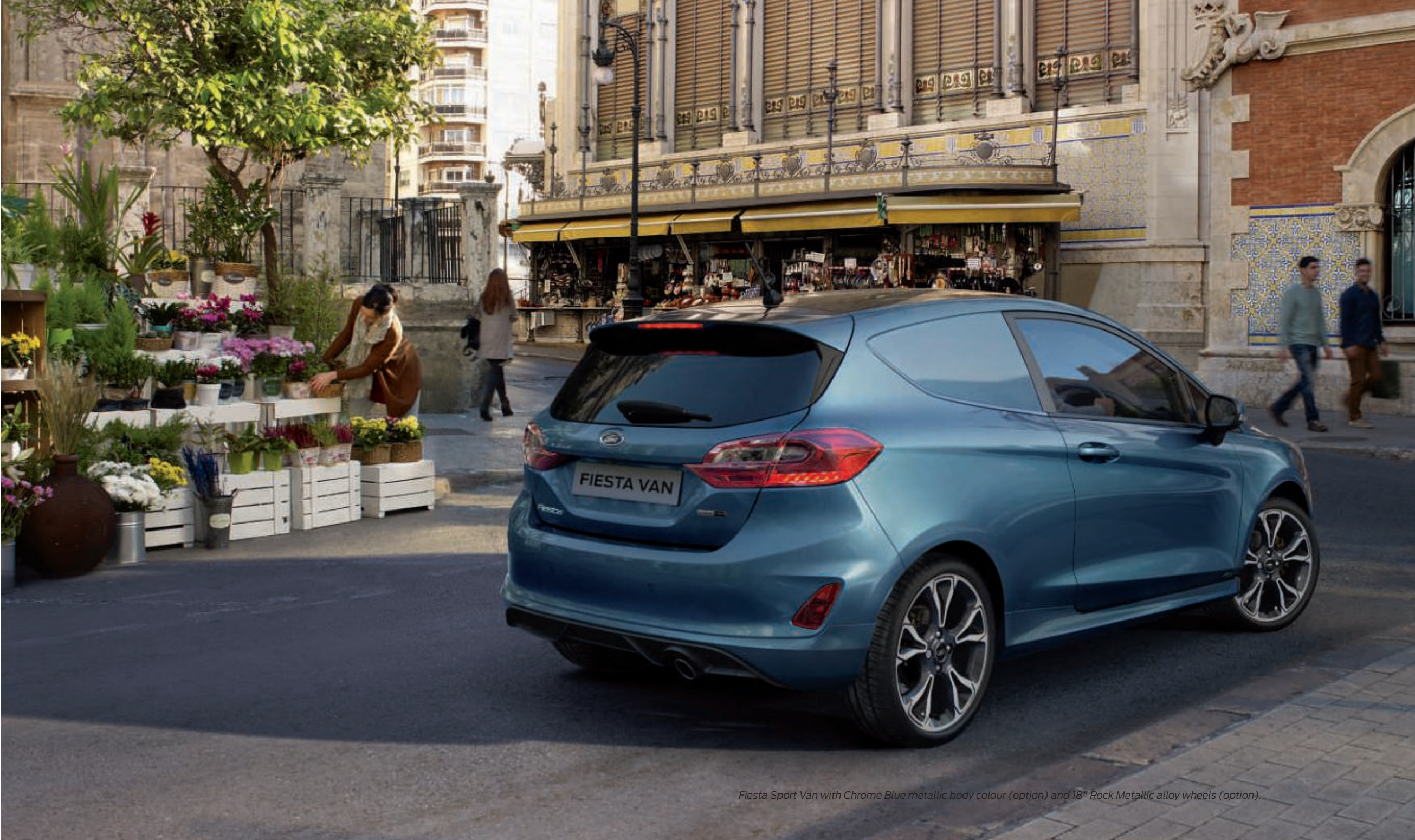
Fiesta Sport Van with Chrome Blue metallic body colour (option) and 18" Rock Metallic alloy wheels (option).

Featuring 48-volt electrified powertrain technology, the new Fiesta Van EcoBoost Hybrid delivers petrol performance and optimised fuel efficiency** without reducing load volume or payload. (Optional)