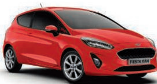
Race Red Solid body colour