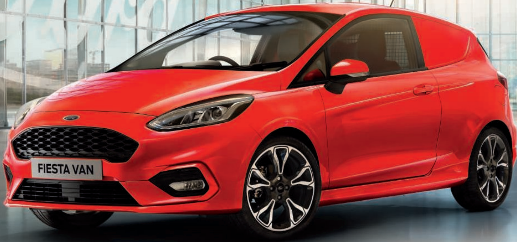
Fiesta Sport Van with Race Red body colour (option) and 18" Rock Metallic / machined alloy wheels (option).