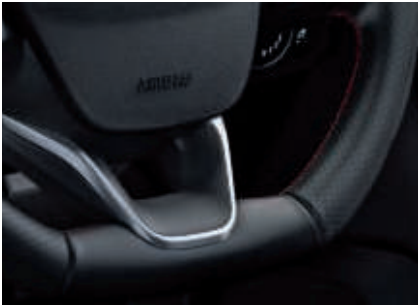
Steering wheel with perforations and red stitching. (Standard)