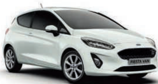
Frozen White Solid body colour*

Zinc coating Phosphate coat Electrocoat Primer Top coat Clearcoat (not with Frozen White body colour*)