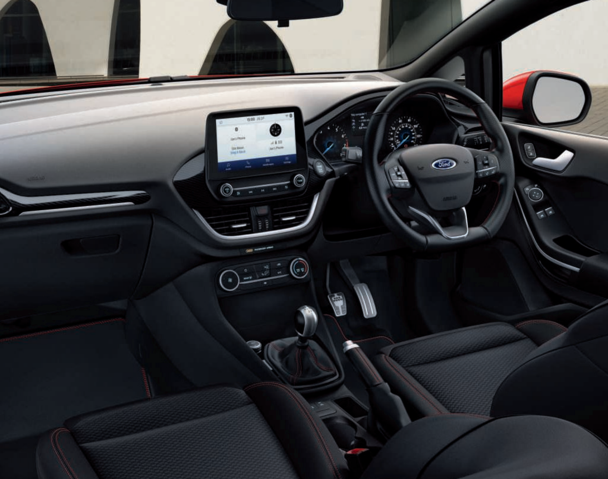
Model shown is a Fiesta Sport Van in Race Red solid body colour (option).