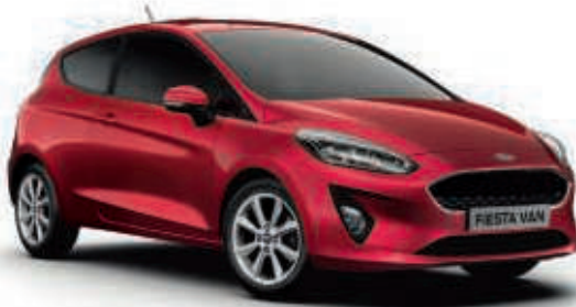
Ruby Red Metallic body colour*

Note The images used are to illustrate body colours only and may not reflect the vehicle described. Colours and trims reproduced within this brochure may vary from the actual colours, due to the limitations of the printing processes used. *Frozen White solid body colour and metallic body colours are options, at extra cost. †Body colour available from mid 2019.