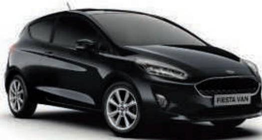
Agate Black Metallic body colour*