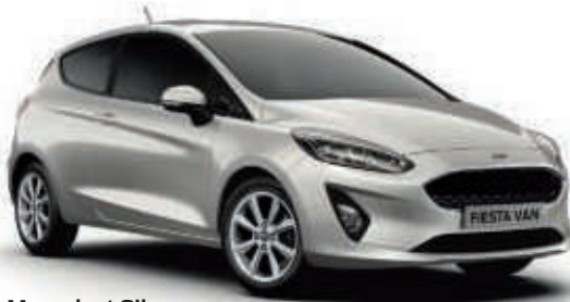
Moondust Silver Metallic body colour*