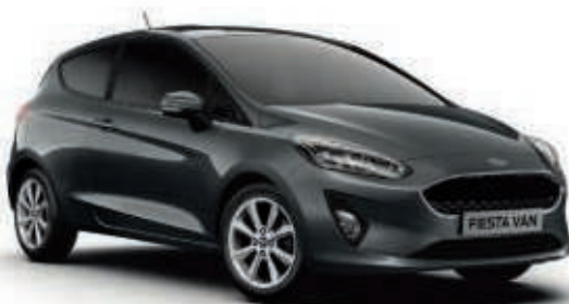
Magnetic Metallic body colour*