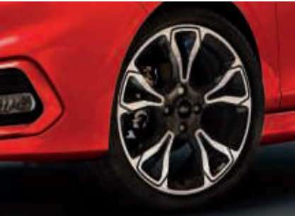
18" Rock Metallic machined alloy wheels. (Option)