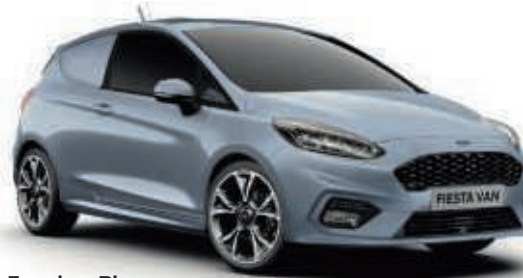
Freedom Blue Metallic body colour*†