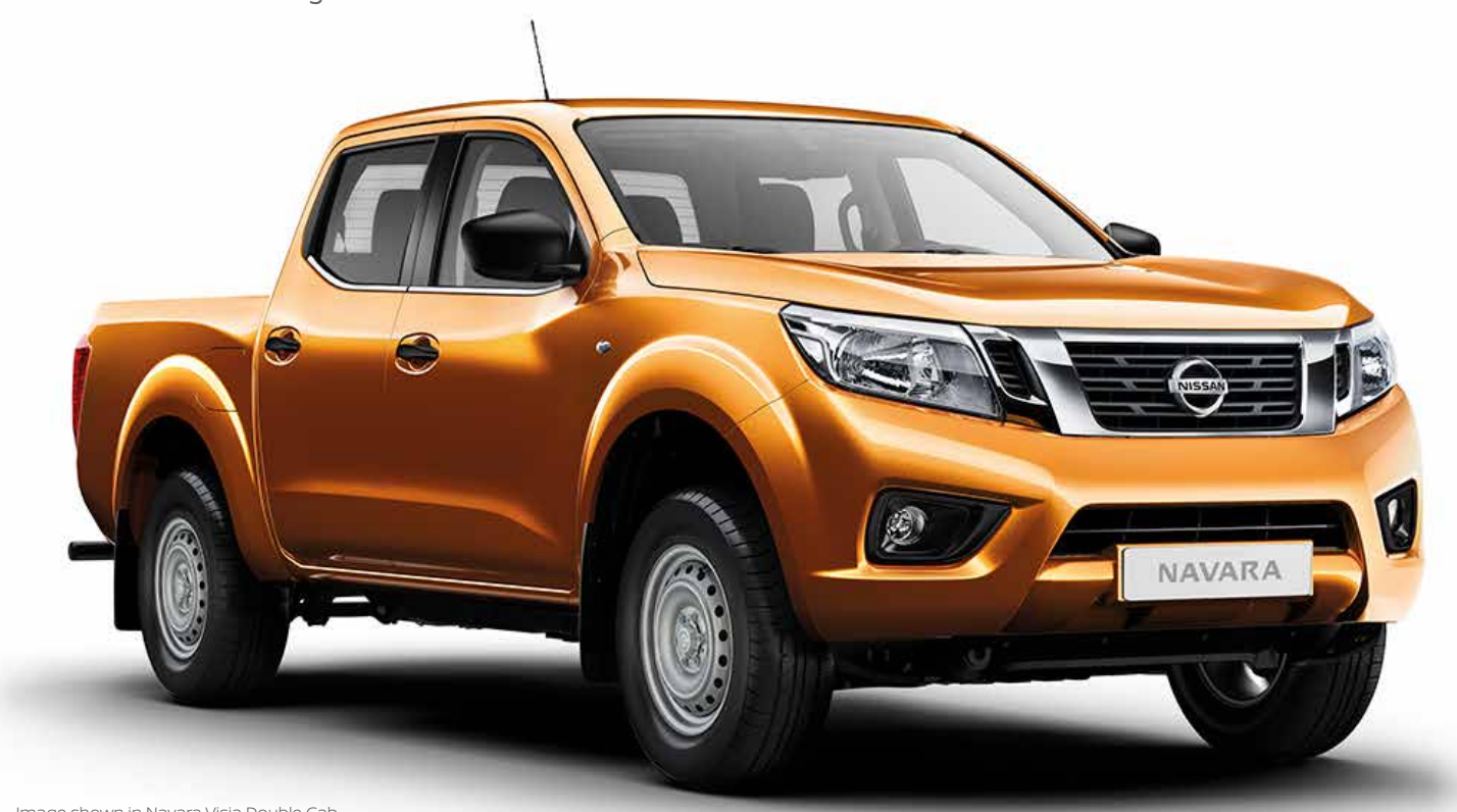
Image shown in Navara Visia Double Cab. *Options available at additional cost