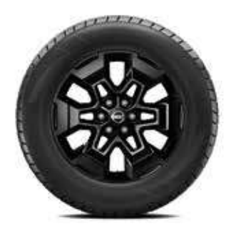
N-GUARD 18" BLACK ALLOY WHEELS