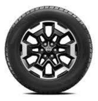
N-CONNECTA and TEKNA 18" ALLOY WHEELS