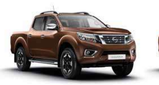
EARTH BRONZE (M)