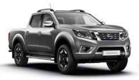
TWILIGHT GREY (M)