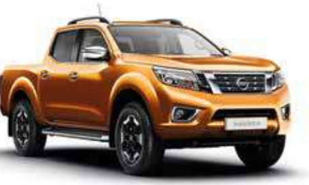
SAVANNAH YELLOW (M)