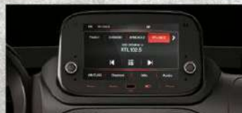
Touchscreen 7" Bluetooth® Radio