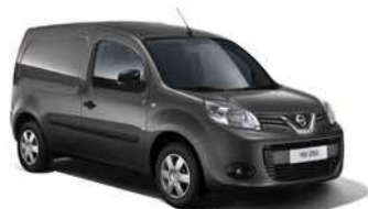
Dark Grey (KNG) M