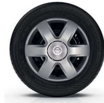
15" Steel wheels with full wheel covers PANEL VAN & CREW VAN