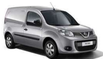
Silver Grey (KQA) M