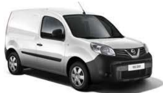
White (QNG) S