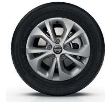
15" Alloy wheels PANEL VAN & CREW VAN (Option) (order code "ALW15")