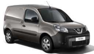
Grey (G25) S