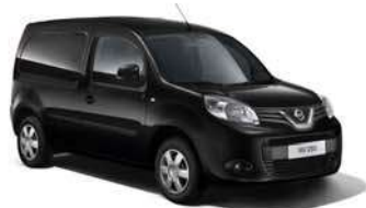
Black (BO0) M