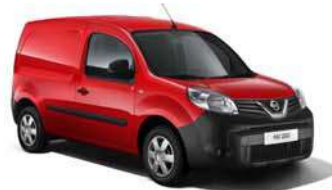
Red (Z52) S