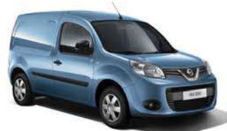
Light Blue (B13) M