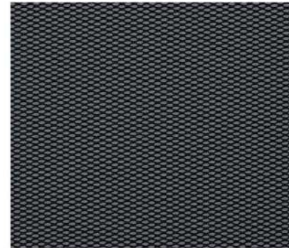
Blended Fabric PANEL VAN & CREW VAN (order code "O")