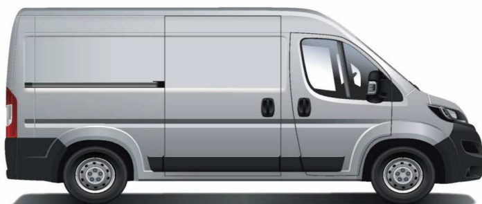
Boxer Window Van