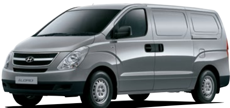
Hyper Silver – Metallic