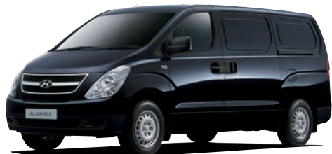
Timeless Black – Mica