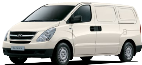
Creamy White – Solid